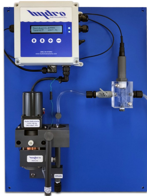
RAH-210-D (with Reagent Feed Pump Kit)